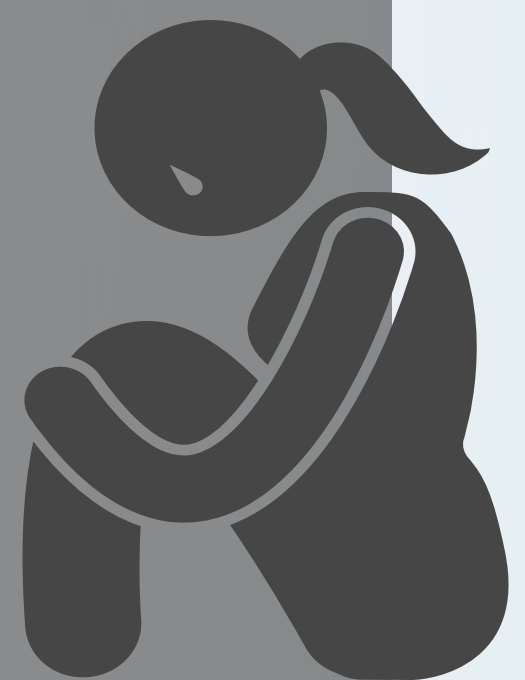
Pre-existing Mental Health Conditions Noted Among Maternal Deaths, Utah, 2015-2016

Despite the prevalence and risk, there is a lack of awareness in the community and among healthcare providers. Mothers often feel they can't share their symptoms due to stigma and doctors often don't ask.